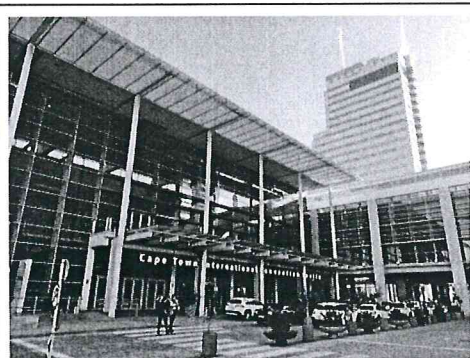
CTICC 1 正門

(一) 今年 FIGO 在開普敦國際會議中心（Cape Town International Convention Centre, CTICC）舉行。該會議中心位於開普敦市中心，有兩個會場（CTICC 1 & 2），中間有空橋相連，行進間可見到著名景點一桌山，令人心曠神怡。本次會議演講場次眾多，使用了 2 個會場，空間開闊，整體感受很舒適。